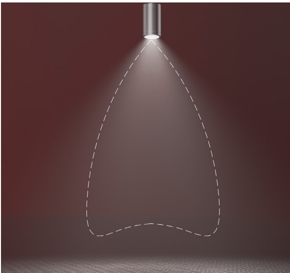
General illumination with batwing distribution with feathered edges provides even illumination on horizontal and vertical surfaces