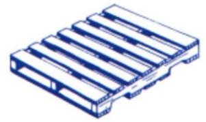
Heavy Duty Stringer Pallet Notched for Four-Way Entry