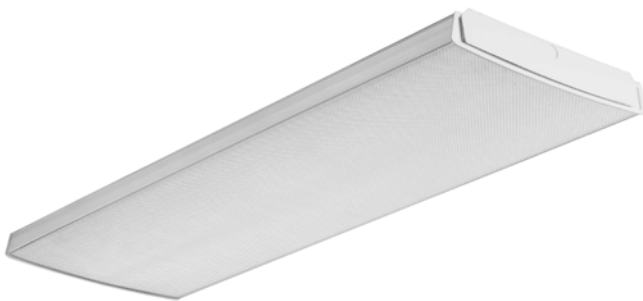
Recalled Lithonia Lighting LBL4W model ceiling light fixture