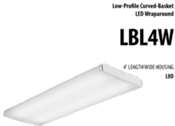
Recalled Lithonia Lighting LBL4W model ceiling light fixture