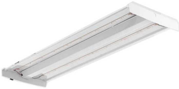
Recalled Lithonia Lighting LBL4W model ceiling light fixture without the lens