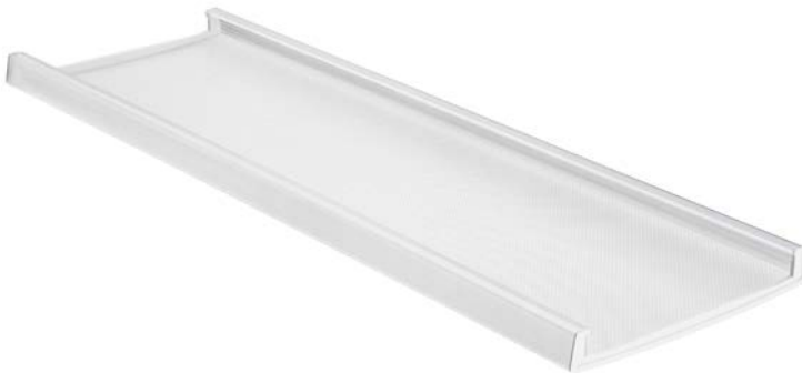
Recalled Lithonia Lighting LBL4W model lens cover inside view