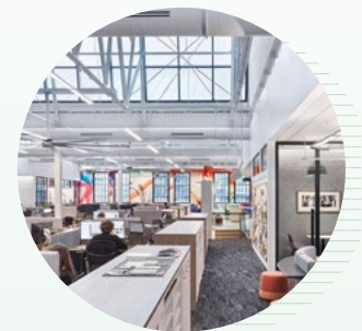
Hickok Cole Headquarters LEED Gold