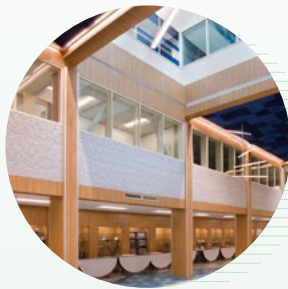
Oyster River Middle School LEED Gold