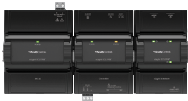
Enabled with Atrius™