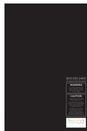
Fresco DXT LPDD Unified DMX512 control panel for LED