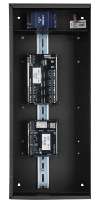
Fresco DXT DMX512-A networking panel