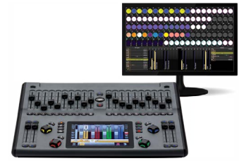
Fresco Show DTP Intelligent DMX512 Control