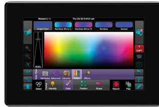
Fresco Show WM Touchscreen Architectural Lighting Touchscreen