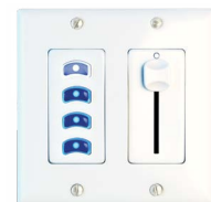
Vignette Stand-alone Button/Slider Station