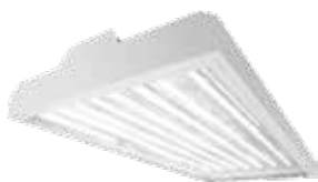
FFB By Lithonia Lighting

ACUITY BRANDS LIGHTING HAS COMPLETE SOLUTIONS FOR COOLER AND FREEZER APPLICATIONS.