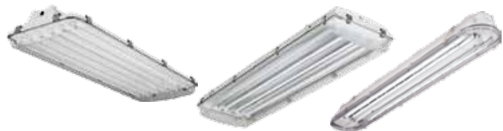
FHF, FHE & VAP LED By Lithonia Lighting

For ordering the FFB or any other lighting fixture with the OnePass Extreme, add OD EXT to the standard catalog number.