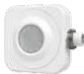
**LT Sensors By Sensor Switch